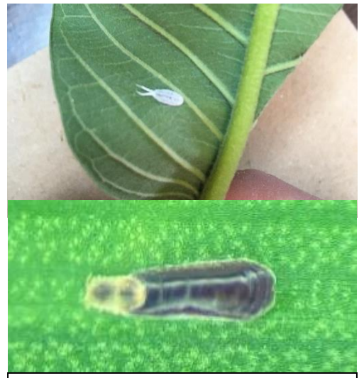
Top: A-rated Ferrisia virgata (striped mealybug) on guave tree from South Carolina

Q-rated pests are those suspected to be of economic or environmental detriment, but its status is uncertain because of incomplete identification due to life stage, or inadequate information on the pest's impact in