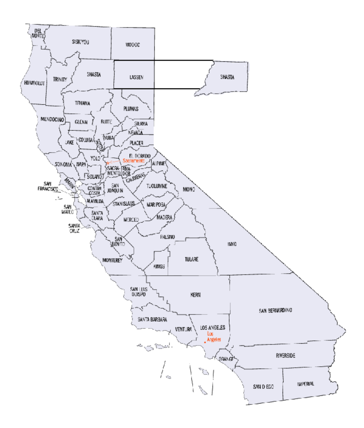
Figure 3-1 Shasta County Air Quality Management District Boundaries