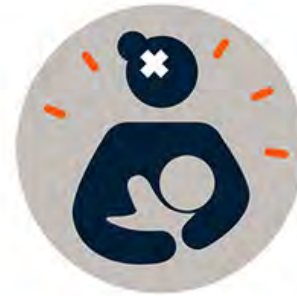
Mother treated violently